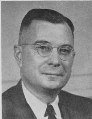
R. STANLEY PENFIELD Sovereign Prince